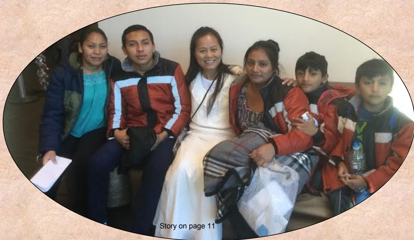
Story on page 11

Called by the Spirit ~ Embracing the World Missionary Sisters Servants of the Holy Spirit Paraclete Province — USA and Caribbean February 2019