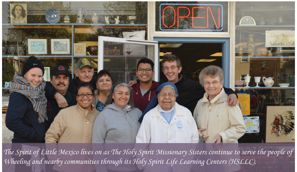
The Spirit of Little Mexico lives on as The Holy Spirit Missionary Sisters continue to serve the people of Wheeling and nearby communities through its Holy Spirit Life Learning Centers (HSLLC).

After almost fifty years of serving the Mexican American communities in the north suburbs of Chicago, the Corporation of Little Mexico was